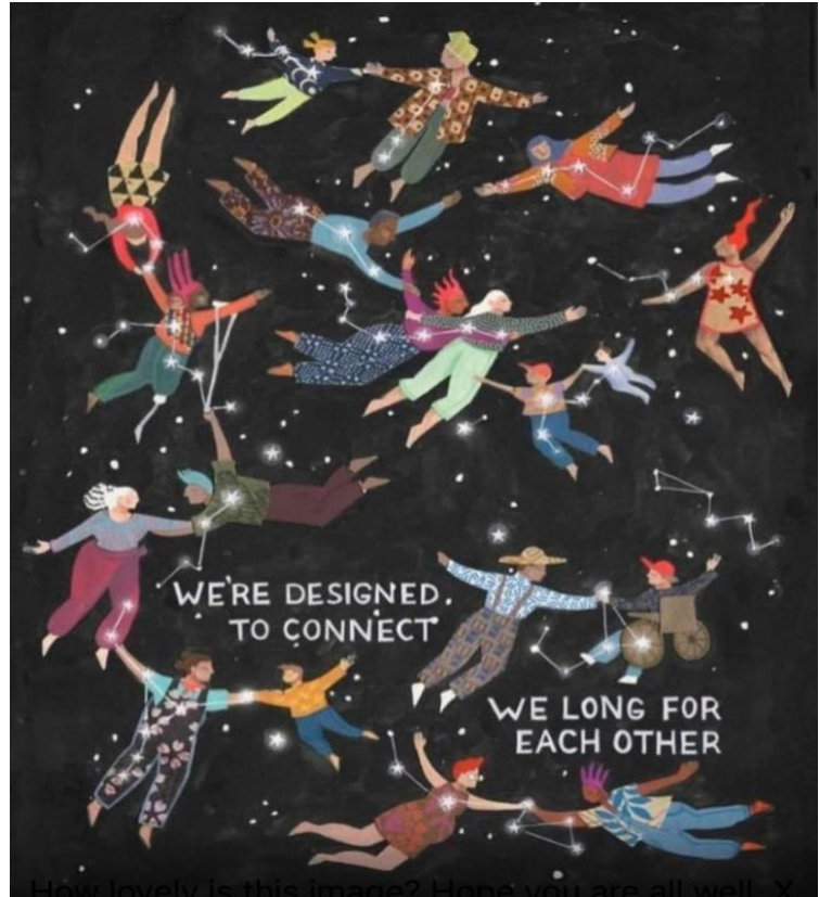
How lovely is this image? Hope you are all well. X

However, whether with our family, friends or work colleagues, it is important to recognise that we need to invest quality time to considering how we keep our relationships healthy.